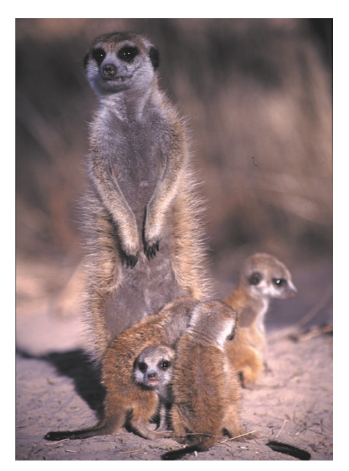
Fig. 1 . Suricata suricatta , demonstrating the typical raised position of the adult used to scan the surroundings. (Photograph courtesy of T.H. Clutton-Brock).

alarm call type to snakes, such as the Cape cobra ( Naja nivea ), puff adder ( Bitis arietans ) and the mole snake ( Pseudaspsis cana ). Snake alarm calls are also given to fecal, urine or hair samples of predators and/or foreign suricates. Because snake alarm calls to all of these stimuli cause other animals to approach the caller, give alarm calls themselves, and either mob the snake or investigate the deposit, they are collectively termed 'recruitment alarm calls' [13].